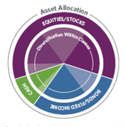
Example is hypothetical and does not represent any particular investment or constitute an investment recommendation.

Next, we have bonds, or fixed-income investments. With bonds, you essentially loan money to companies or governments. In exchange for your investment, the entity pays you interest for a pre-determined number of years. At the end of the term, the bond will mature and (provided the entity